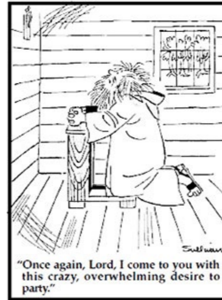
from JoyfulNoiseletter.com