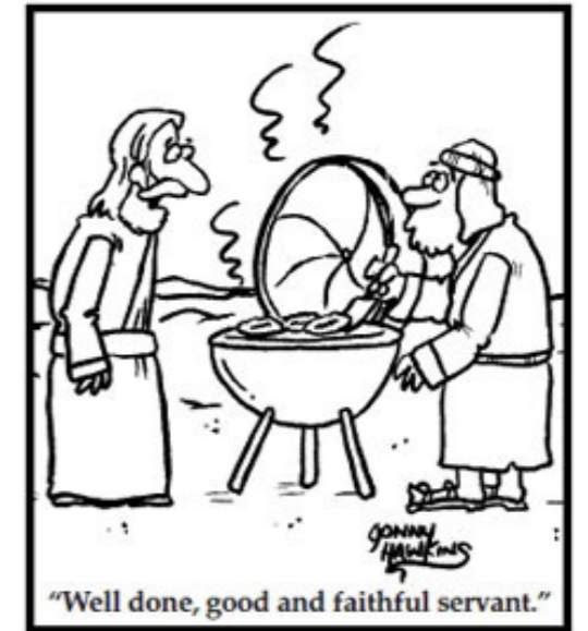
from JoyfulNoiseletter.com Reprinted with permission