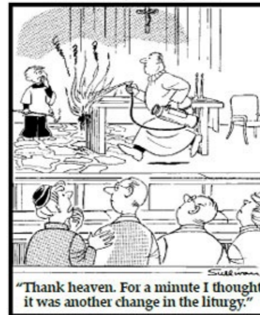
from JoyfulNoiseletter.com